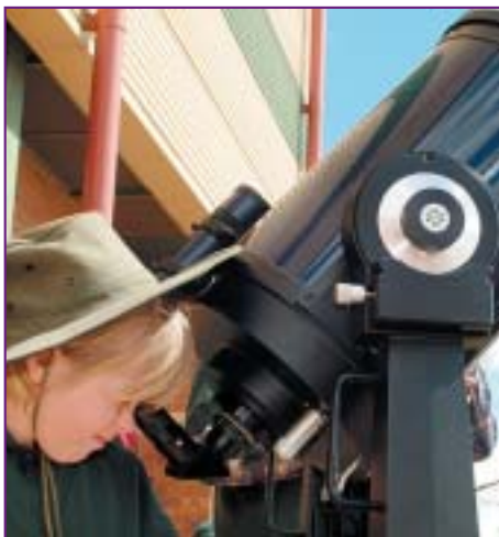
DANIELLE ACHILLES from Darling Heights State School takes a peek at sunspots on the surface of the sun for the solar viewing activity.