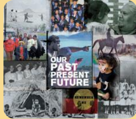
Survival and Protection