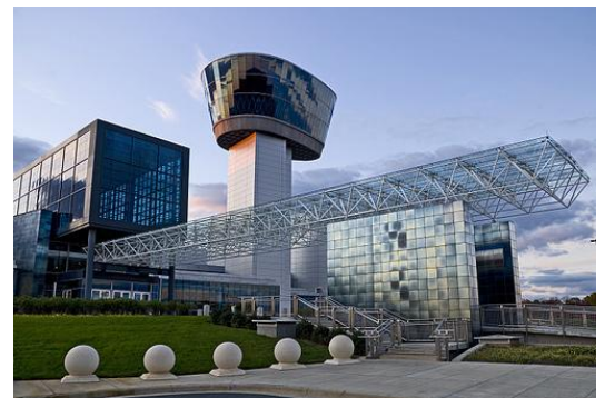
The Smithsonian National Air & Space Museum's Steven F. Udvar-Hazy Centre