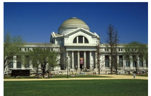
The Smithsonian National Museum of Natural History