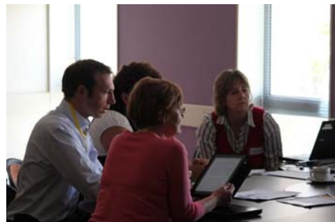
Participants at the workshops