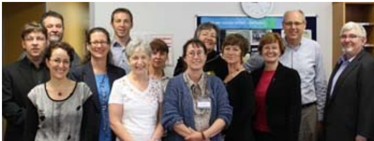
ANU visitors with USQ staff

Additionally, the morning session of the workshop included a Moodle 'speed-dating' session discussing the installation and working processes used in or in conjunction with Moodle. Anyone interested in finding out more about the interesting work and collaboration that is happening between the universities should register for the USQ – ANU Moodle Community site - http://snipurl.com.usq-anu – the enrolment key is USQ –ANU