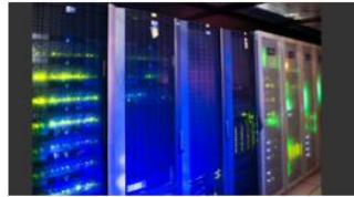
Access to HPC