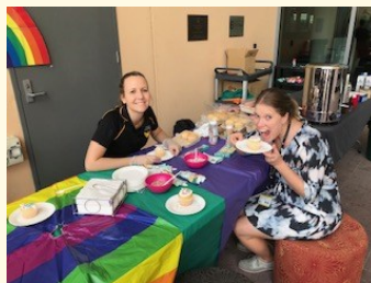
Springfield cupcake appreciation

The rainbow flag flew proudly over our campuses in celebration of IDAHOBIT (International Day Against Homophobia, Biphobia, Interphobia & Transphobia). Much rainbow cake was consumed! Well done everybody on a successful event. We hope you were able to check in with us at one of the locations.