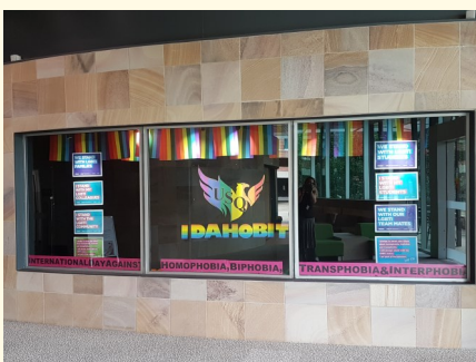
Ipswich library window display and rainbow flag