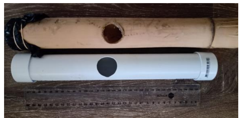
Figure 1: PVC and bamboo pipe traps showing the side entrance.