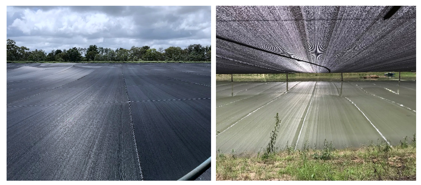
▲ View of shade cloth cover from above and below

The structure was damaged in 2019, when one of the cables broke and sections of the covered subsided. Apart from repairing this damage, the maintenance has been minor and limited to repairing cloth tears.